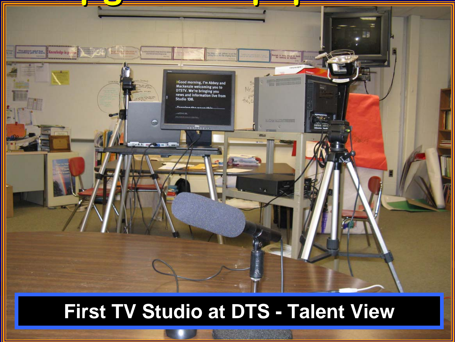
First TV Studio at DTS - Talent View